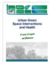
Urban Green Space Interventions & Health, 2017 (in English)