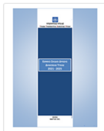
National Public Health Action Plan 2021-2025 (in Greek)