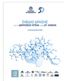
Action Plan for Public Health in the 21st Century (in Greek)