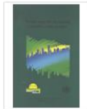
Twenty steps for developing a Healthy Cities project, 1997 (in English)