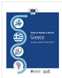
State of Health in the EU- Greece-Country Health Profile 2017 (in English)