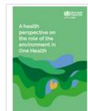
A health perspective on the role of the environment in One Health, 2022 (in English)