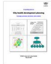
Working tool on City health development planning, 2001 (in English)