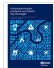
Urban planning for resilience and health: key messages, 2022 (in English)