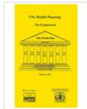
City Health Plan, 1996 (in English)