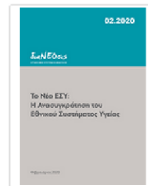
The new NHS - The Reconstruction of the National Health System (in Greek)