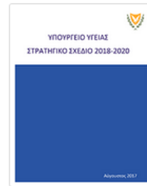
Ministry of Health - Strategic Plan 2018-2020