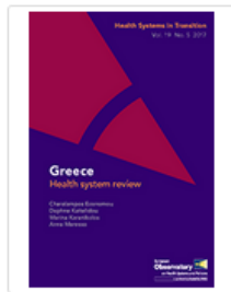
Greece - Health System Review (in English)