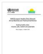
Building healthy cities: inclusive, safe, resilient and sustainable (in English)