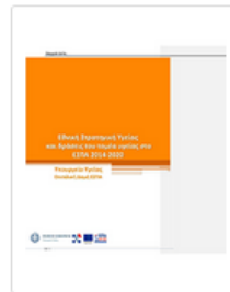
National Health Strategy and Actions of the Health sector in the NSRF 2014-2020 (in Greek)