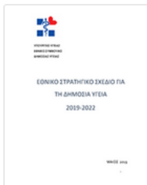
National Strategic Plan for Public Health 2019-2022 (in Greek)