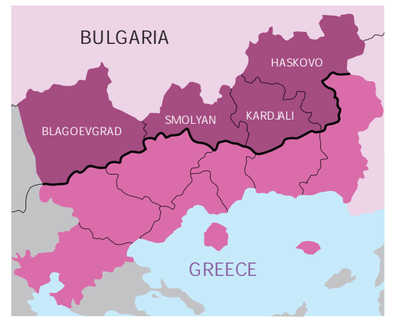
* Cross-border Area: Region of Eastern Macedonia and Thrace, Region of Central Macedonia (Greece), Regions of Blagoevgrad, Smolyan, Kardjali and Haskovo (Bulgaria)..

The Project "Support of Social Enterprises Development and Enhancement of Employment / SoSEDEE" is realised in the framework of the Cross-border Cooperation Programme Interreg V-A Greece Bulgaria 2014-2020. The Project aims to contribute in the enhancement of employment of individuals belonging to vulnerable social groups and residing in the cross-border area* of the Cooperation Programme, through a Training Course, the attending of which will help them gain the appropriate knowledge and develop the necessary skills for the establishment and operation of e cient Social Enterprises.